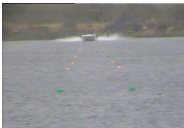
Not enough zoom and image too grainy