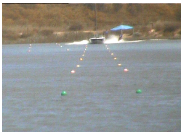
Not enough zoom and image too grainy