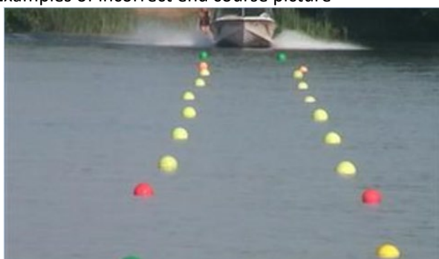
Edges of the monitor not visible